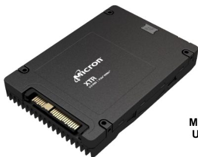
Micron XTR SSD U.3: 15mm

The result? The Micron XTR provides significantly better value than Intel Optane SSDs.